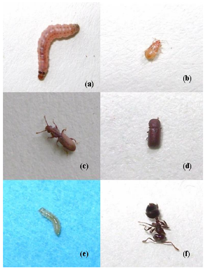
Fig. 3. Morphology of the spoilage fungus isolated from Madhuca latifolia flowers. (a) Family Noctuidae (b) Fam. Anthocoreidae (c) Fam. Cucujidae (d) Fam. Bostrychidae (e) Fam. Tephritidae (f) Fam. Formicidae.

International Journal of Agricultural Technology 2013, Vol. 9(1): 227-235